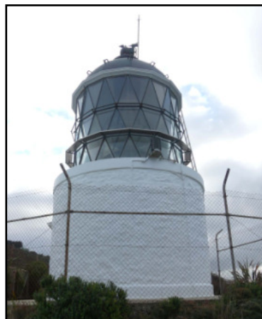
Florence & Nugget Point lighthouses, shorter than Cape Campbell