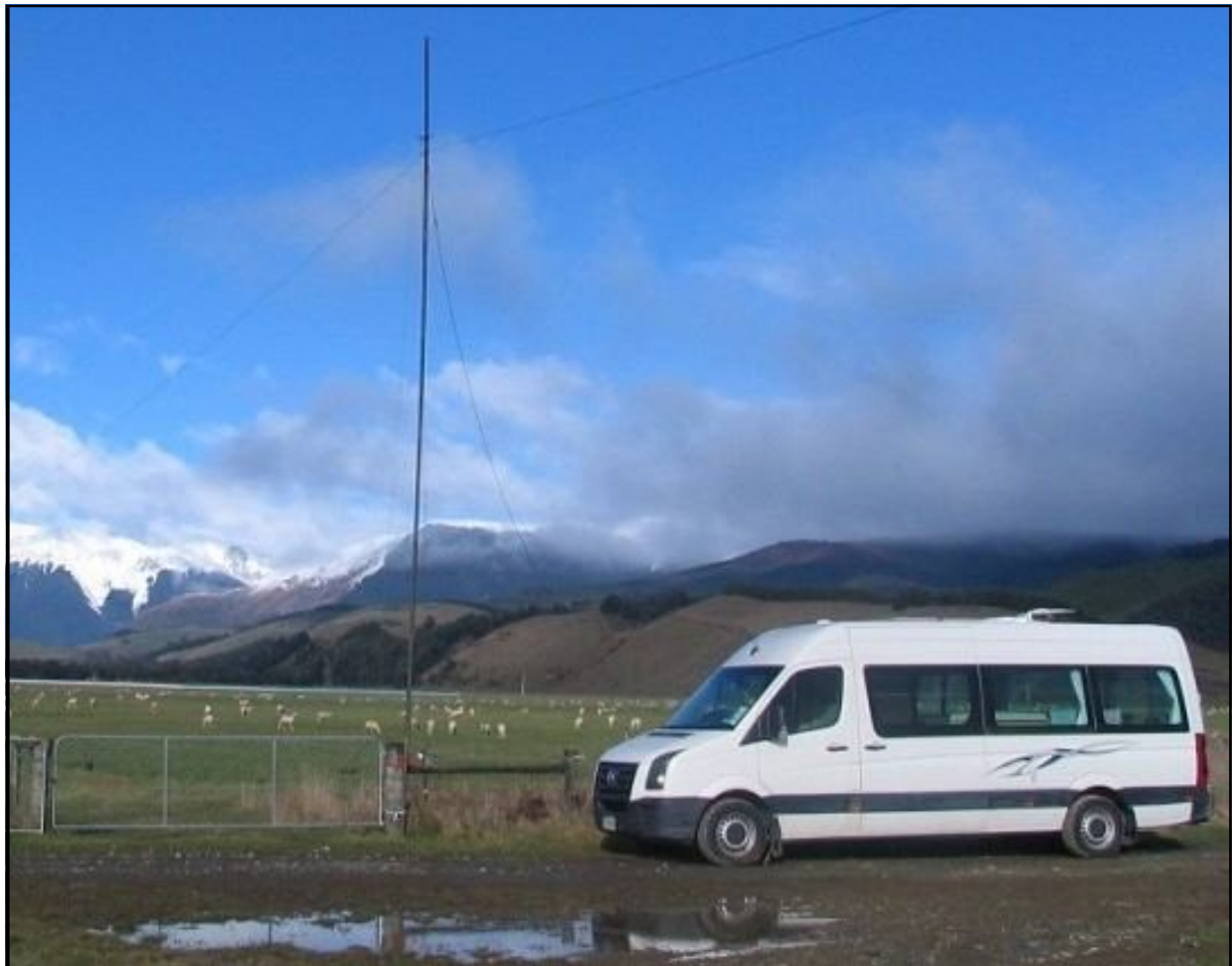
Bill, ZL2AYZ's, "shack" at Lake Station (near St Arnaud) for the VK-Tasman Low Bands Contest on the 16 th July. The antenna is a 160m off-centre fed dipole. The weather was quite kind although it was very muddy in the paddocks!

VHF - USB Net Wednesdays 1930 144.150MHz