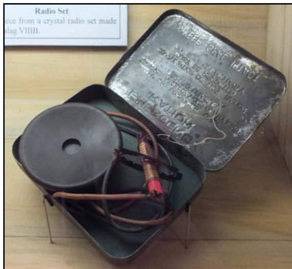
Earpiece from a crystal radio set made in Stalag V111B. Part of a display in the Waiouru Army Museum.

WE HAVE TRAINED OUR MOTORBIKES NOT TO CLIMB ON TO CHILDREN.....PLEASE MAKE SURE YOUR KIDS ARE SAFE AND KEPT OFF THEM.