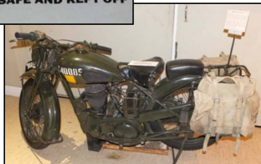
Sign on the seat of this BSA motorbike in the Waiouru Army Museum.

WE HAVE TRAINED OUR MOTORBIKES NOT TO CLIMB ON TO CHILDREN.....PLEASE MAKE SURE YOUR KIDS ARE SAFE AND KEPT OFF THEM.