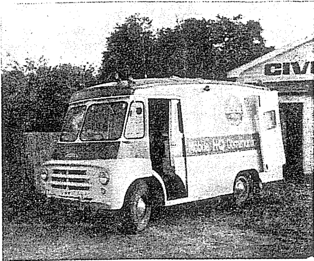
The Marlborough Civil Defence Communications Vehicle.

network. This vehicle has been fitted out with hazard lights, spot lights, HF, UHF, VHF equipment, as well as the "E800U" Honda generator, gas stove and awning on one side, capable of accommodating 4 persons. The vehicle is now used for CD exercises and as forward base for most SAREXs and searches. AREC in Marlborough is very active with approximately 3 SAREX's being held each year consisting of 2 one day exercises and a weekend exercise. We participate in various paper exercises and of course in AREC Field Day every year.