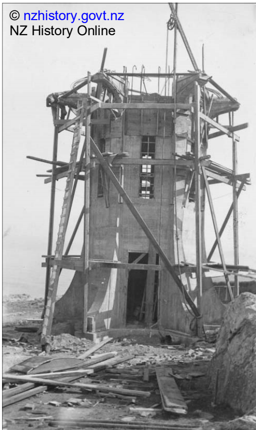
Baring Head lighthouse construction 1934. Replaced Pencarrow light and became operational in 1935. First lighthouse in NZ to use electricity to power its light and was automated in 1989.