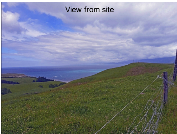
View from site