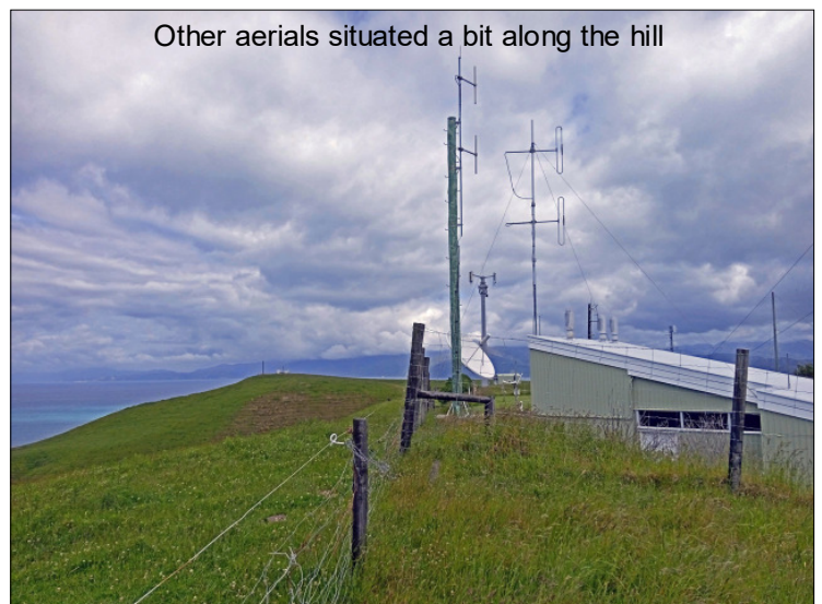
Other aerials situated a bit along the hill