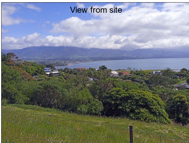
View from site