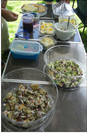
More salads on the left

Desserts included a couple of pavlovas, a delicious rice dish, chocolate brownies, cream puffs, trifle, pumpkin pie, strawberries and cheesecake.