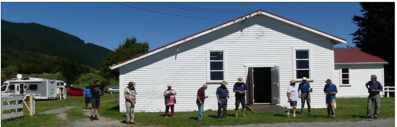
This is the start of the 2021 Fox Hunt outside the Carluke Hall, showing access gate on left

RSVP to caryl@simtronics.co.nz by 6 March for catering purposes please!