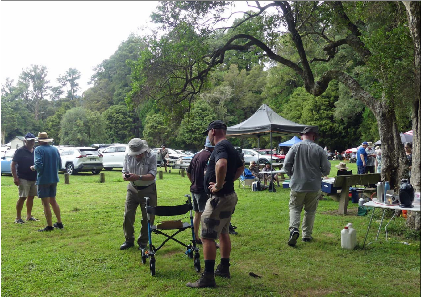
Radios getting turned on and tuned in to listen for the fox.